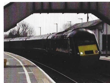
soon to be withdrawn

WEEKEND TRAVEL Train times are often changed at weekends to enable maintenance work to be carried out. Times shown are a guide and should be confirmed prior to travelling ↓ ↓ TELEPHONE ENQUIRIES 03457 43 49 50